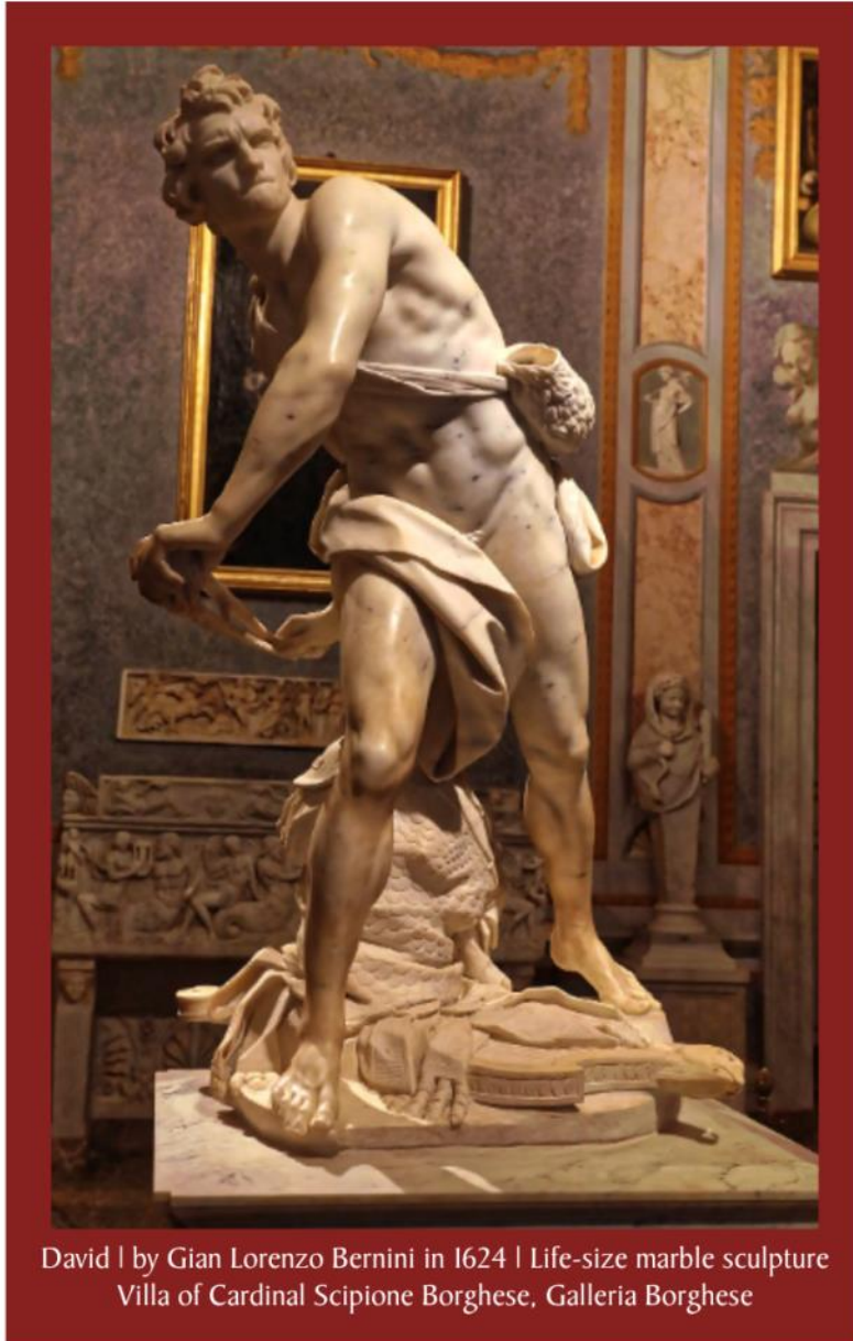
David I by Gian Lorenzo Bernini in 1624 | Life-size marble sculpture Villa of Cardinal Scipione Borghese, Galleria Borghese