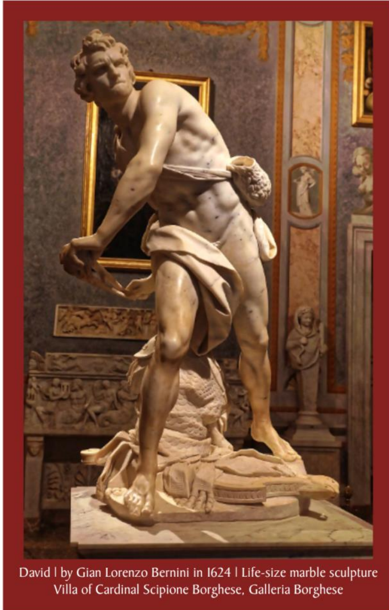
David I by Gian Lorenzo Bernini in 1624 | Life-size marble sculpture Villa of Cardinal Scipione Borghese, Galleria Borghese